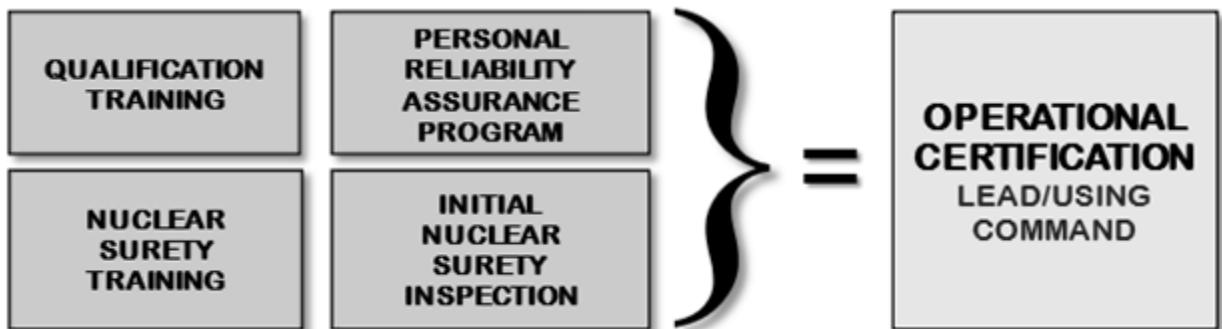
Figure 1.3. Operational Certification Components.

Program, DoDM 5210.42_AFMAN 13-501, Nuclear Weapons Personnel Reliability Program (PRP), AFI 90-201, The Air Force Inspection System, and Chairman Joint Chiefs of Staff Instruction (CJCSI) 3263.05D, Nuclear Weapons Technical Inspection.