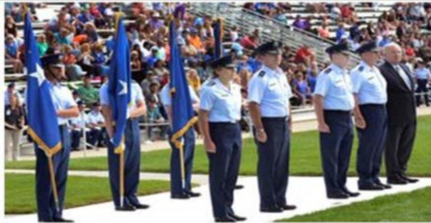
Figure A7.1. Photos Example.