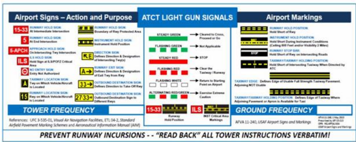
Figure 1. Light Gun Signals.

2.3.4.1. When directed by the tower to exit the CMA, personnel will immediately exit via the closest available taxiway and remain at least 150’ from the runway.