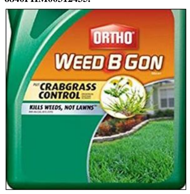
Figure A2.1. Weed B Gone Max Weed Killer®: 1.5 gallon jug (limit 1 each) 6840PHM00312435.

A2.2. Authorized pesticide purchases with GPC card.