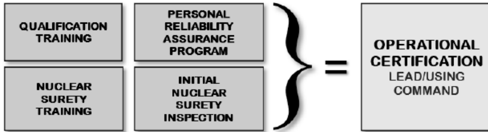
Figure 1.3. Operational Certification Components.