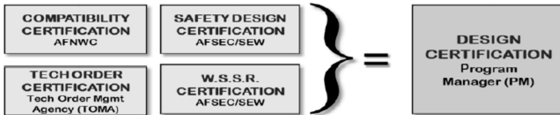
Figure 1.2. Design Certification Components.

1.3.2.1. The AFNWC, Surety and Certification Division (AFNWC/NTS) provides compatibility certification. Reference Military Standard (MIL-STD) -1822B, Nuclear Compatibility Certification of Nuclear Weapon Systems, Subsystems, and Support Equipment .