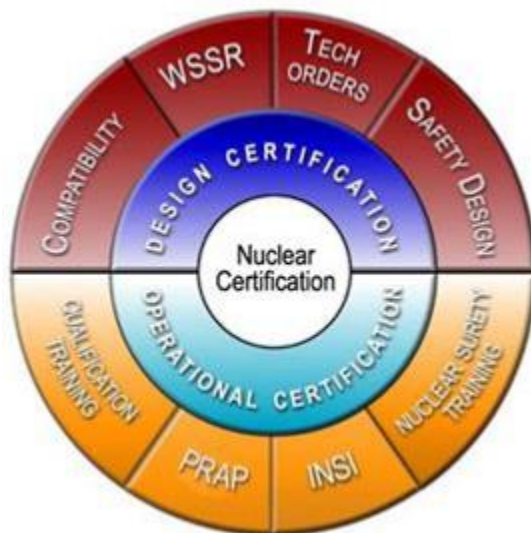
Figure 1.1. Nuclear Certification Major Elements and Components.

Legend: WSSR=Weapon System Safety Rules; PRAP=Personnel Reliability Assurance Program; INSI=Initial Nuclear Surety Inspection