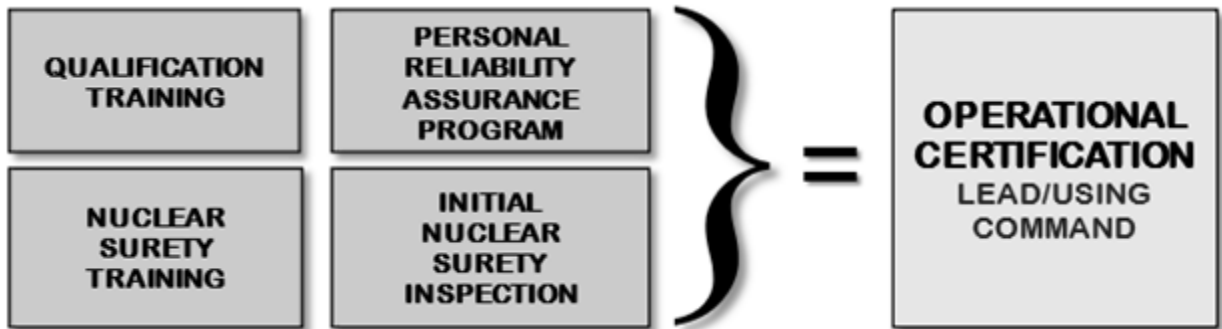
Figure 1.3. Operational Certification Components.

Program, DoDM 5210.42_AFMAN 13-501, Nuclear Weapons Personnel Reliability Program (PRP), AFI 90-201, The Air Force Inspection System, and Chairman Joint Chiefs of Staff Instruction (CJCSI) 3263.05D, Nuclear Weapons Technical Inspection.