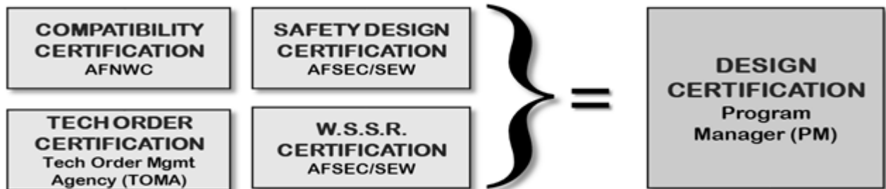
Figure 1.2. Design Certification Components.

1.3.2.1. The AFNWC, Surety and Certification Division (AFNWC/NTS) provides compatibility certification for aircraft; air-launched missile systems; support equipment; and nuclear maintenance, handling, and storage facilities. The AFNWC, ICBM Systems Directorate (AFNWC/NI) provides compatibility certification for ICBM systems. Reference Military Standard (MIL-STD) -1822B, Nuclear Compatibility Certification of Nuclear Weapon Systems, Subsystems, and Support Equipment .