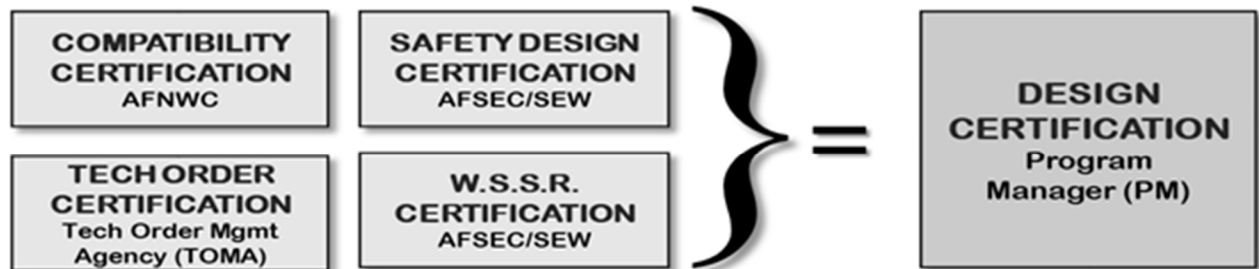
Figure 1.2. Design Certification Components.

1.3.2.1. The AFNWC, Surety and Certification Division (AFNWC/NTS) provides compatibility certification for aircraft; air-launched missile systems; support equipment; and nuclear maintenance, handling, and storage facilities. The AFNWC, ICBM Systems Directorate (AFNWC/NI) provides compatibility certification for ICBM systems. Reference Military Standard (MIL-STD) -1822B, Nuclear Compatibility Certification of Nuclear Weapon Systems, Subsystems, and Support Equipment .