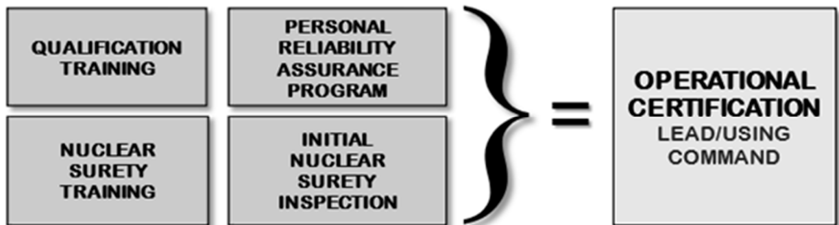
Figure 1.3. Operational Certification Components.

Program, DoDM 5210.42_AFMAN 13-501, Nuclear Weapons Personnel Reliability Program (PRP), AFI 90-201, The Air Force Inspection System, and Chairman Joint Chiefs of Staff Instruction (CJCSI) 3263.05D, Nuclear Weapons Technical Inspection.