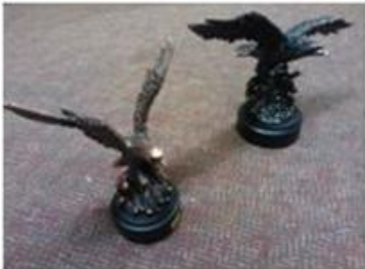
Figure 10.2. Daedalian AETC Commander's Trophy Plate.