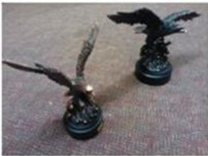
Figure 9.1. Order of Daedalians AETC Commander's Trophy.

9.3.1. Attach a suitable brass plate to the base and engrave as depicted in Figure 9.2 .