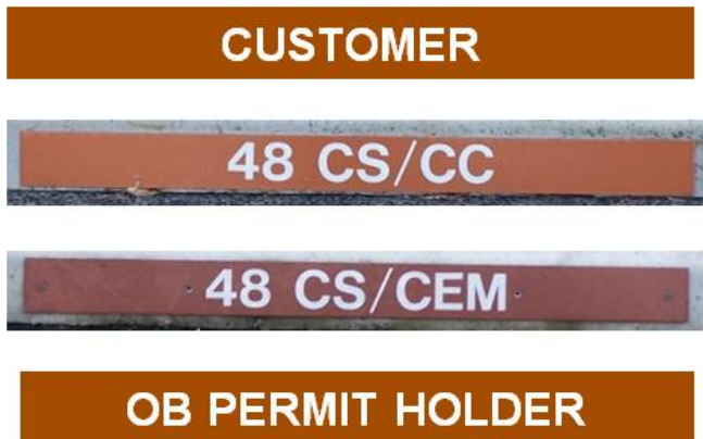
Figure A2.11. Temporary Reserved Parking Sign.