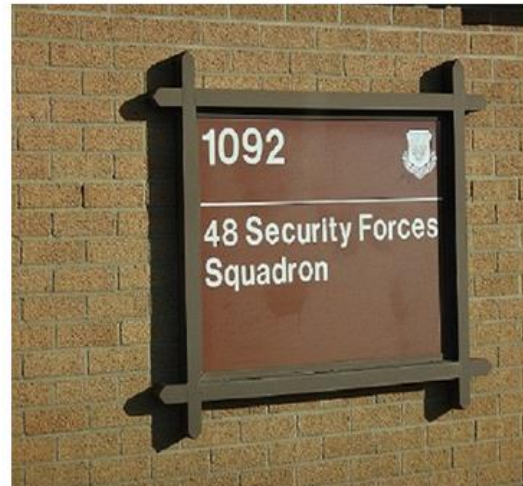
Figure A2.4. Military Identification Sign, B-3 – Community Facility with Additive Sign.