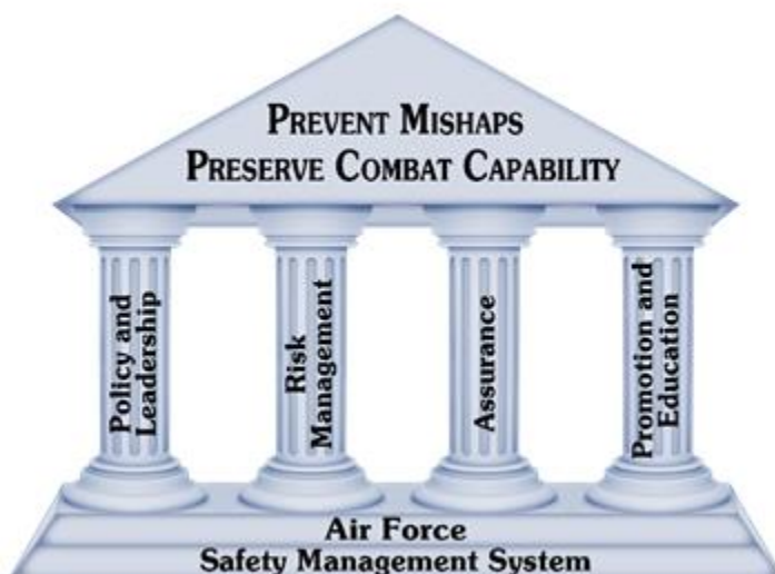
Figure 1.1. AFSMS Pillars.

1.3. Use of AFSMS in the Mishap Prevention Program. Mishap prevention activities are assigned to one of the four Safety Management System (SMS) pillars as depicted in Figure 1.1 . Commanders at all levels are responsible for developing and implementing a mishap prevention program utilizing the AFSMS Pillars.