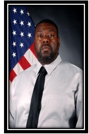
Steven Nolan Complaints and Resolution

FW&A Hotlines 355 FW/IG: 228-3177 ACC/IG: (757) 764-8712 SAF/IG: (800) 538-8429 DoD/IG: (800) 424-9098