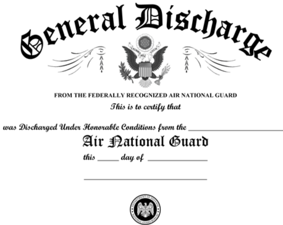
Figure A7.1. Example NGB Form 439A.