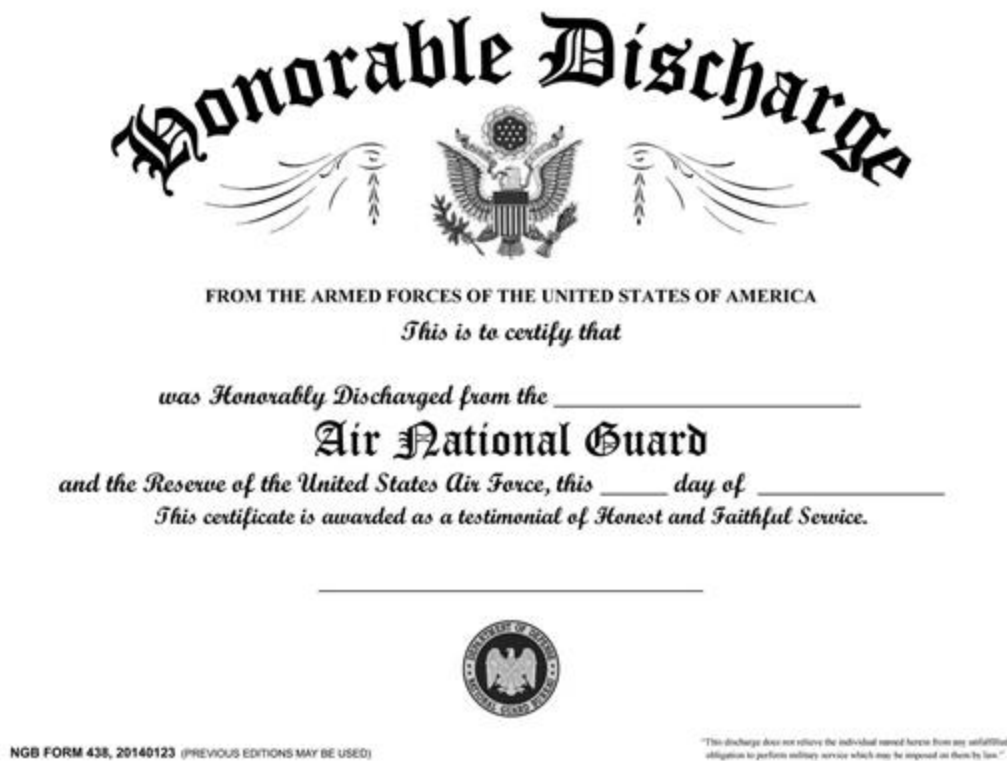
Figure A4.1. Example of NGB Form 438.