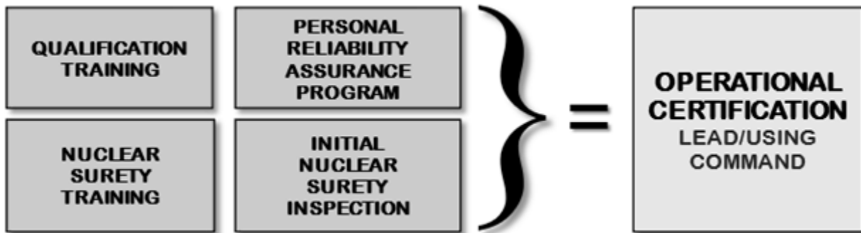
Figure 1.3. Operational Certification Components.

certification of the first unit. Subsequent units receiving the new or modified system/item undergo an initial Nuclear Surety Inspection conducted by the using command prior to being considered nuclear capable. Reference AFI 91-101, Air Force Nuclear Weapons Surety Program , DoDM 5210.42_AFMAN 13-501, Nuclear Weapons Personnel Reliability Program (PRP) , AFI 90-201, The Air Force Inspection System , and Chairman Joint Chiefs of Staff Instruction (CJCSI) 3263.05D, Nuclear Weapons Technical Inspection .