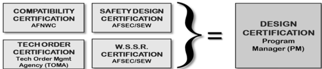
Figure 1.2. Design Certification Components.

1.3.2.1. The AFNWC, Surety and Certification Division (AFNWC/NTS) provides compatibility certification for aircraft; air-launched missile systems; support equipment; and nuclear maintenance, handling, and storage facilities. The AFNWC, ICBM Systems Directorate (AFNWC/NI) provides compatibility certification for ICBM systems. Reference Military Standard (MIL-STD) -1822B, Nuclear Compatibility Certification of Nuclear Weapon Systems, Subsystems, and Support Equipment .