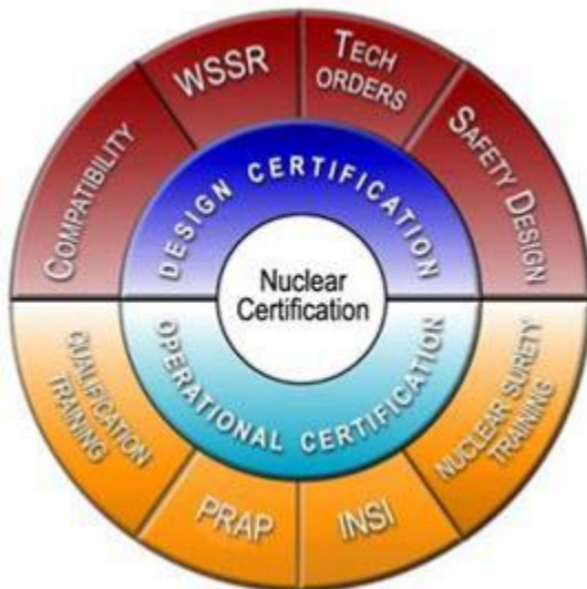
Figure 1.1. Nuclear Certification Major Elements and Components.

Legend: WSSR=Weapon System Safety Rules; PRAP=Personnel Reliability Assurance Program; INSI=Initial Nuclear Surety Inspection