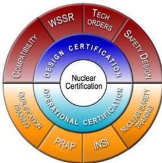
Figure 1.1. Nuclear Certification Major Elements and Components.

Legend: WSSR=Weapon System Safety Rules; PRAP=Personnel Reliability Assurance Program; INSI=Initial Nuclear Surety Inspection