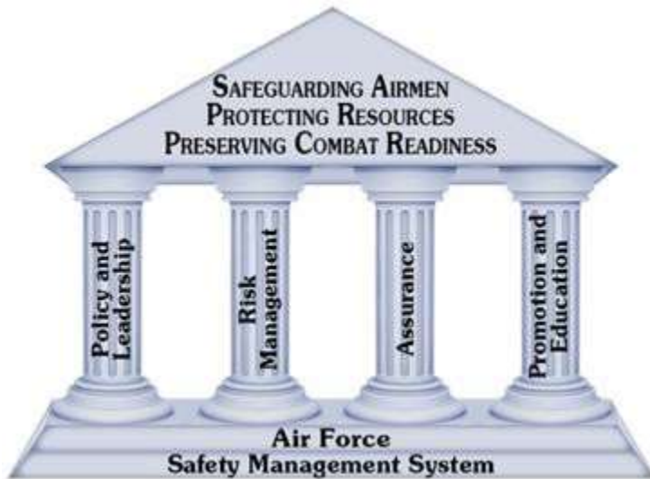
Figure 13.1. AFSMS Pillars.

13.1.2. Leadership implements the mishap prevention program by providing guidance and goals, establishing safety responsibility and accountability, applying risk management to all activities, and promoting the program throughout the organization. The result is a program designed to prevent mishaps, safeguard Airmen, protect resources and preserve combat readiness.