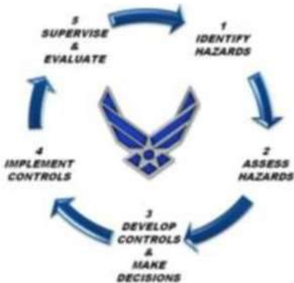
Figure 13.3. The Air Force 5-Step RM Process.

13.1.3.3. Assurance. Safety assurance is how commanders determine the elements of the mishap prevention program are implemented, and guides continuous improvement efforts. The assurance functions of evaluation, monitor, and review measure whether organizations conform to standards and are making progress toward established goals.