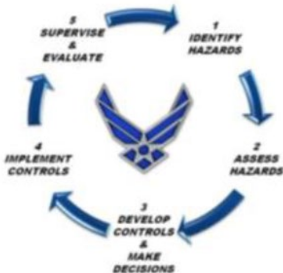
Figure 13.3. The Air Force 5-Step RM Process.

13.1.3.3. Assurance. Safety assurance is how commanders determine the elements of the mishap prevention program are implemented, and guides continuous improvement efforts. The assurance functions of evaluation, monitor, and review measure whether organizations conform to standards and are making progress toward established goals.