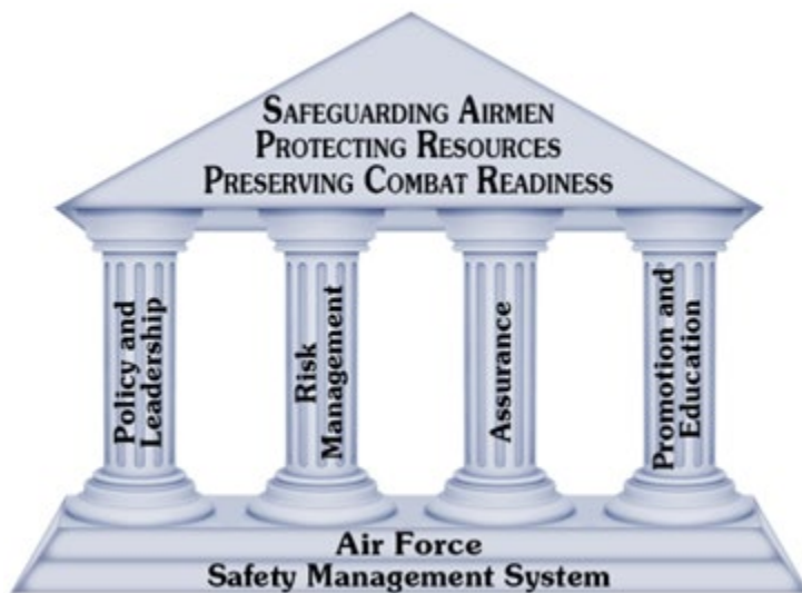
Figure 13.1. AFSMS Pillars.

13.1.2. Leadership implements the mishap prevention program by providing guidance and goals, establishing safety responsibility and accountability, applying risk management to all activities, and promoting the program throughout the organization. The result is a program designed to prevent mishaps, safeguard Airmen, protect resources and preserve combat readiness.