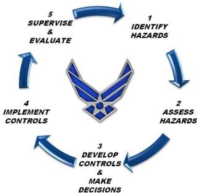
Figure 3.2. 5-Step Risk Management Process.

3.3.1. (Step 1) Identify the Hazards. Step one of the RM Process involves application of appropriate hazard identification techniques in order to identify hazards associated with the operation or activity. Hazards can be defined as any real or potential condition that can cause mission degradation; injury, illness, death to personnel or damage to or loss of equipment or property. Key aspects of this step include: