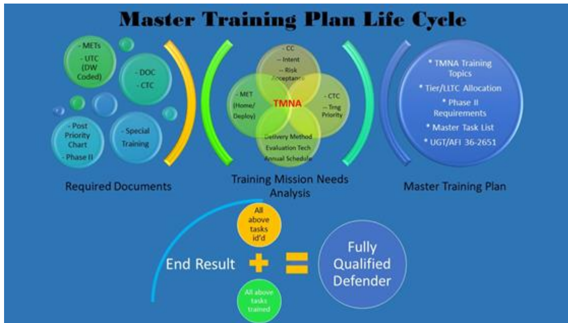
Figure 4.2. Master Training Plan Life Cycle.

4.1.8. Identify upgrade training and other applicable requirements set forth in AFI 36-2651.