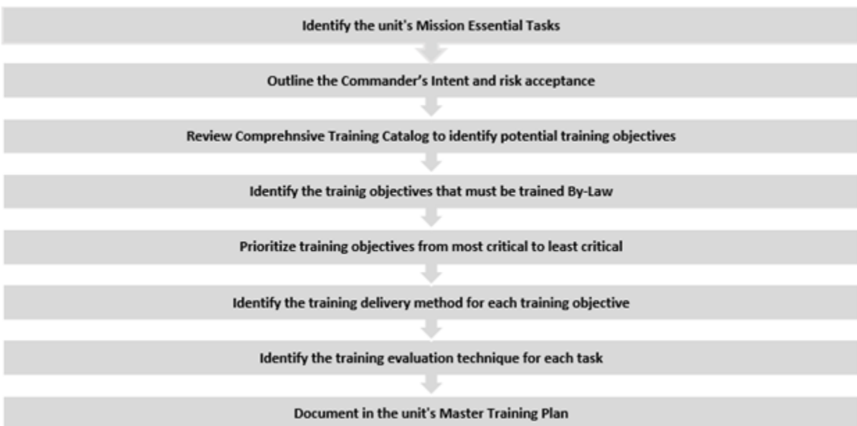
Figure 4.1. Training Mission Needs Analysis.