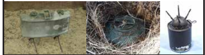
Class D - Landmines