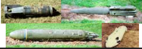
Class A- Bombs and Dispensers 3' - 6' Long