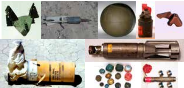
Class E - Bomblets