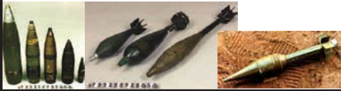
Class C - Projectiles and Mortars