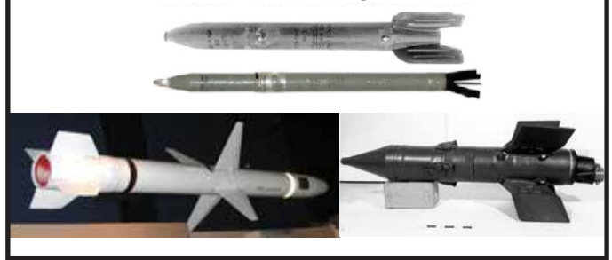
Class B - Rockets and Missiles 5' - 8' Long