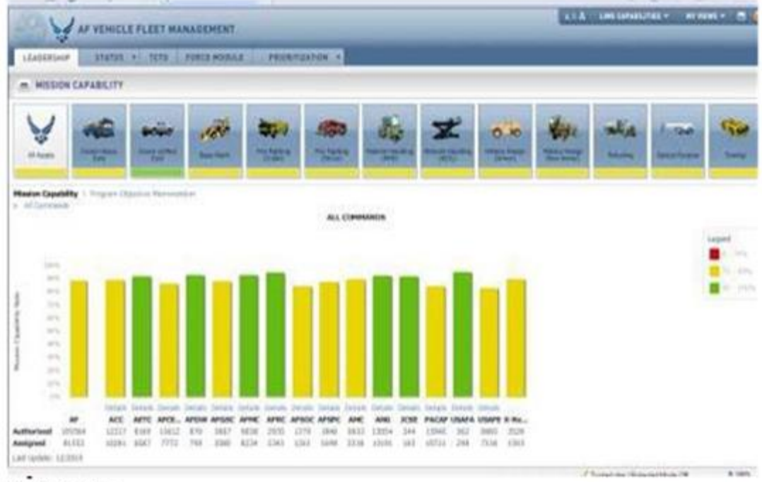
Figure A4.1. LIMS-EV Vehicle View.