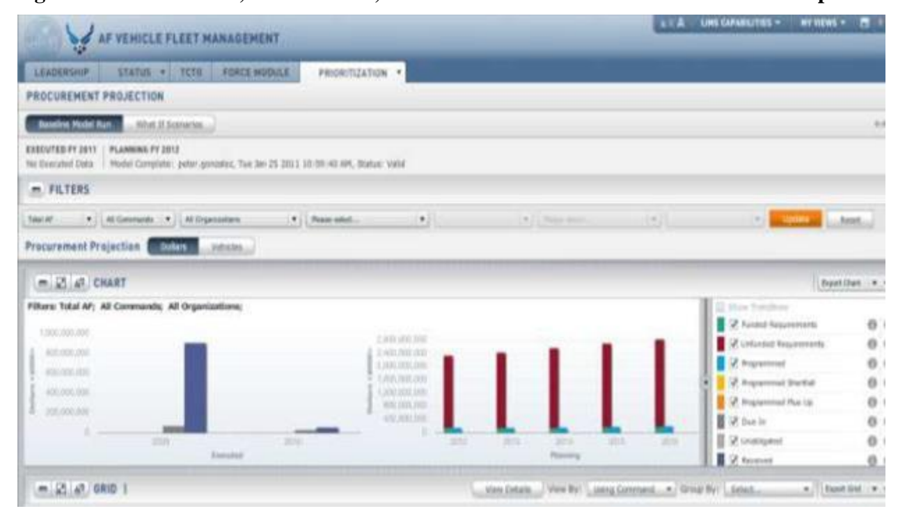
Figure A2.1. LIMS-EV, Vehicle View, Prioritization Tab/Baseline Model Run Example.

A2.3.4.10. The system is locked on predetermined date to generate prioritization list for execution. Save execution list in the system and generate metrics for analysis. Base level VM activities can run the model with "what if" scenarios.