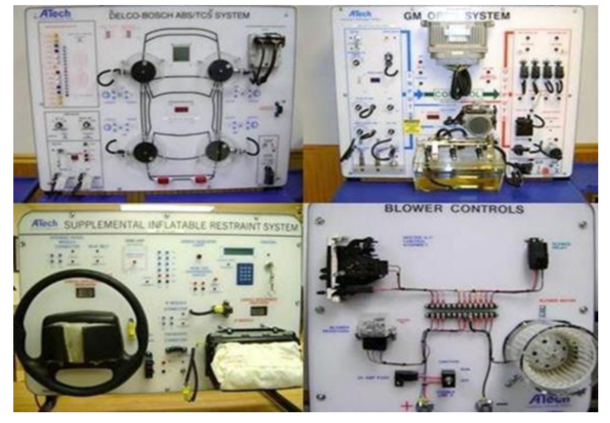
Figure 6.1. Vehicle Management Training Aids.