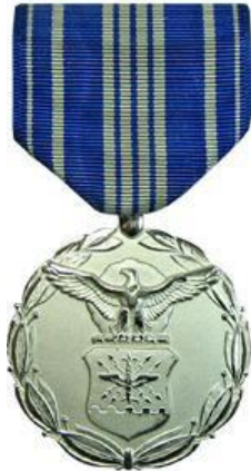
(Added)(DAF) Figure 8. Air and Space Civilian Achievement Award.

c. (Added)(DAF) Award Description. A pewter-colored medal bearing the Department of the Air Force coat of arms within a wreath of laurel leaves. The ribbon has three sets of four vertical stripes of silver gray on an ultramarine blue background. An illustration of the medal is provided at Figure 8.