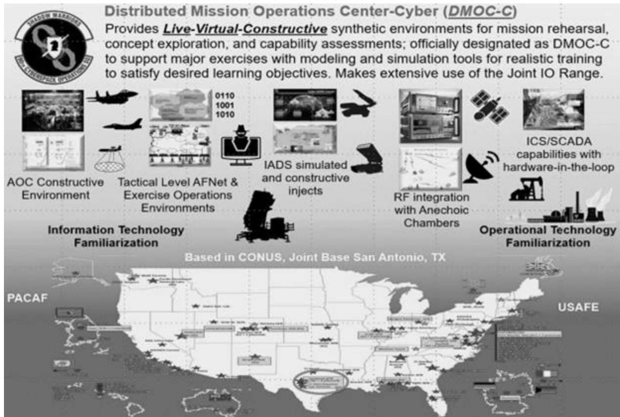
Figure A8.2. DMOC – Cyber Multi-Domain Training System Integration.

Description: DMOC-C provide the synthetic environment for mission rehearsal, concept exploration, and capability assessments; officially designated as DMOC-C to support major exercises with M&S tools for realistic training to satisfy desired learning objectives. The below diagram is a pictorial representation of multi-domain integration.