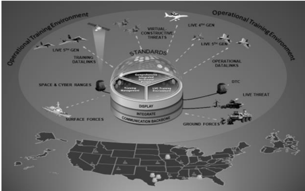
Figure A8.1. Multi-Domain Training System Integration.

Description: The Air Force Future Operating Concept describes an environment in 2035 in which “integrated multi-domain operations will encompass full interoperability among air, space, and cyberspace capabilities.” The below diagram is a pictorial representation of multi-domain integration.