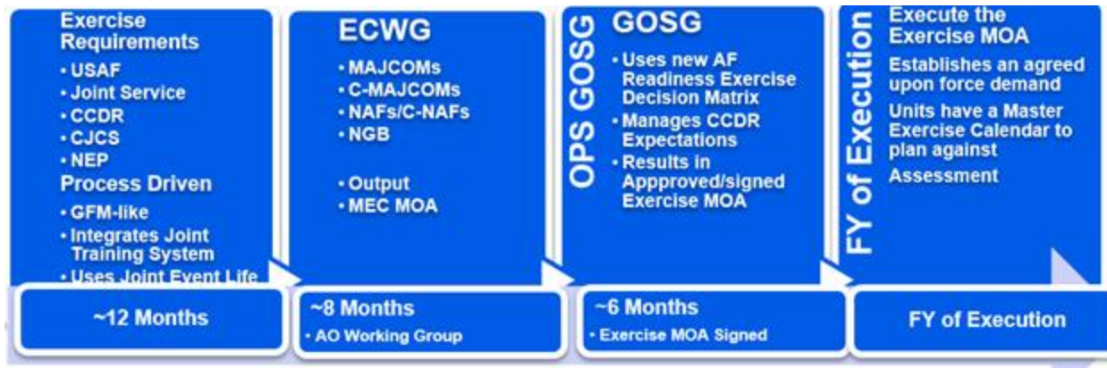
Figure 2.1. Exercise Coordination Working Group.

2.13.5. The ECWG chair will establish the timing of events and deliverables based on synchronization with MAJCOM/C-MAJCOM, NAF/C-NAF and NGB exercise build timelines. Figure 2.1 provides a temporal view of the ECWG inputs, outputs, and approval process.