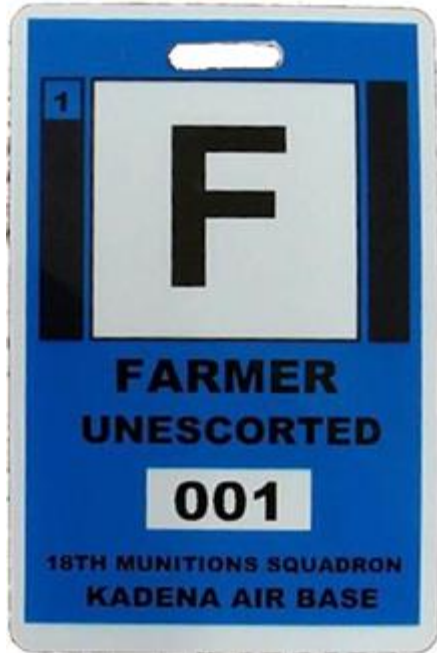
Figure A7.1. Farmer Badge.